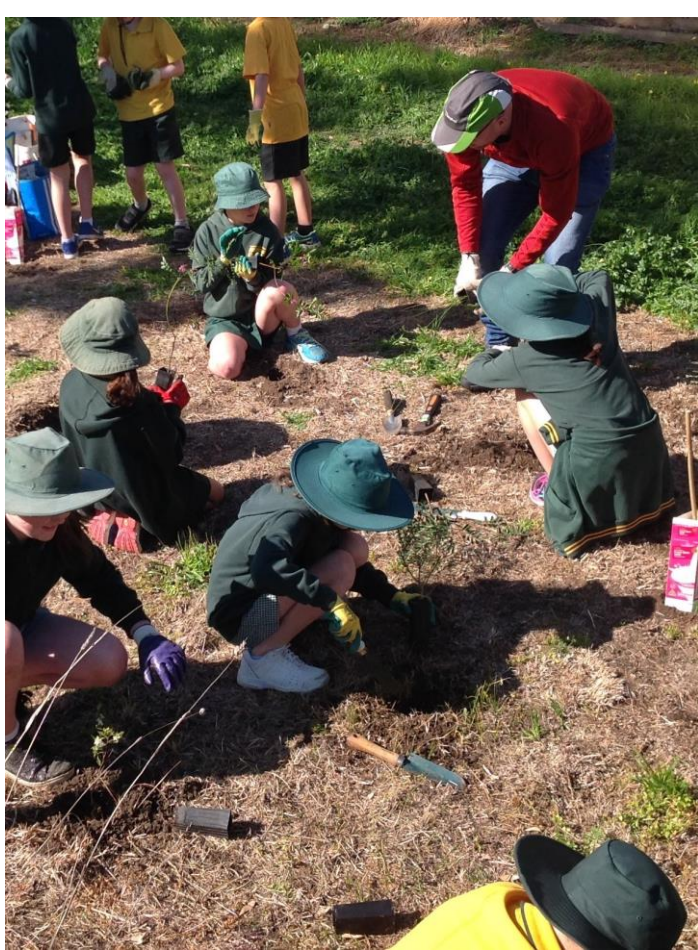
Left to Right: Plant propagation and revegetation activity by Leopold PS Students